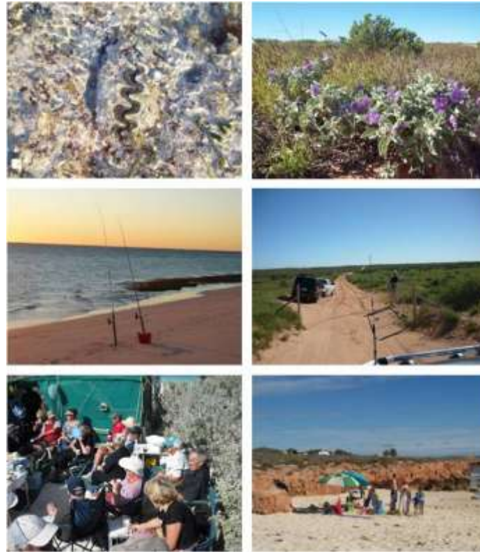
Figure 2: Examples of participants’ photographs illustrating the three overarching categories of the physical environment, recreational activities and social situations.