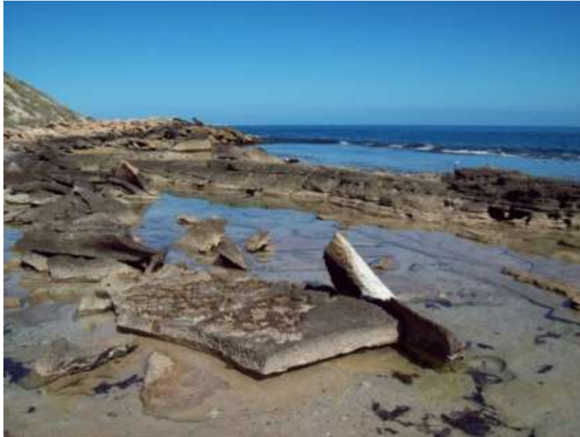
Figure 3: Participant’s photograph showing the lagoon