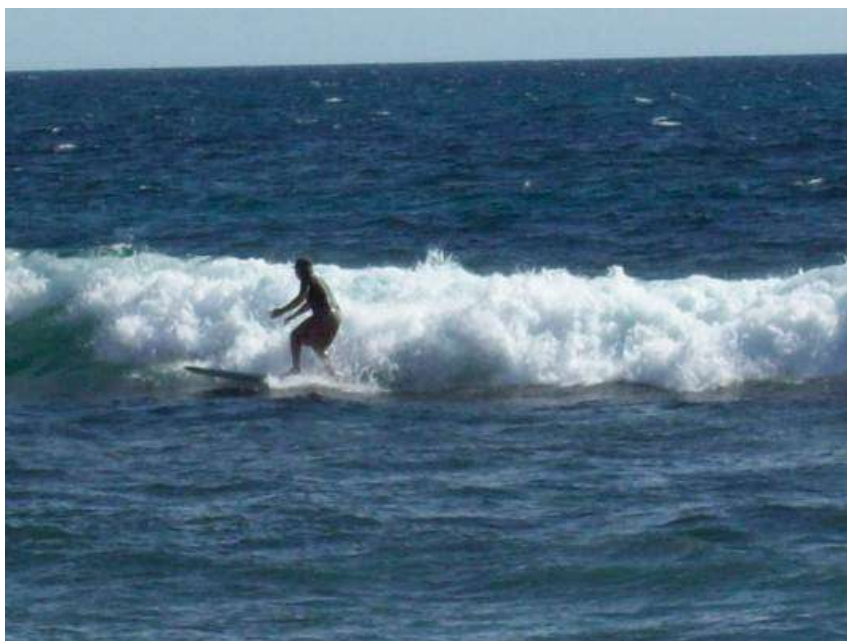
Figure 4: Surfing is an important aspect of some participants’ experiences

“The surf as well, but if you said why wouldn’t you come back, it would be onshore (wind) and none of the friends would turn up, if we knew that the surf was not going to be on and none of our friends would be here, that would be our criteria for nah, no, not going...” (3 Mile participant)